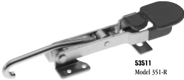
53511 Model 351-R

Model 351-R is supplied with a release lever catch accessory which allows the clamp to lock in the closed position only. Large handle pad improves operability of the clamp. Handle is red vinyl-dipped.